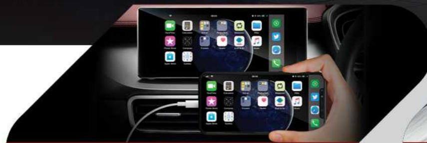
Smartphone Connectivity Mirror-link your Android or iOS smartphone to the IHU for easy access to your favourite apps