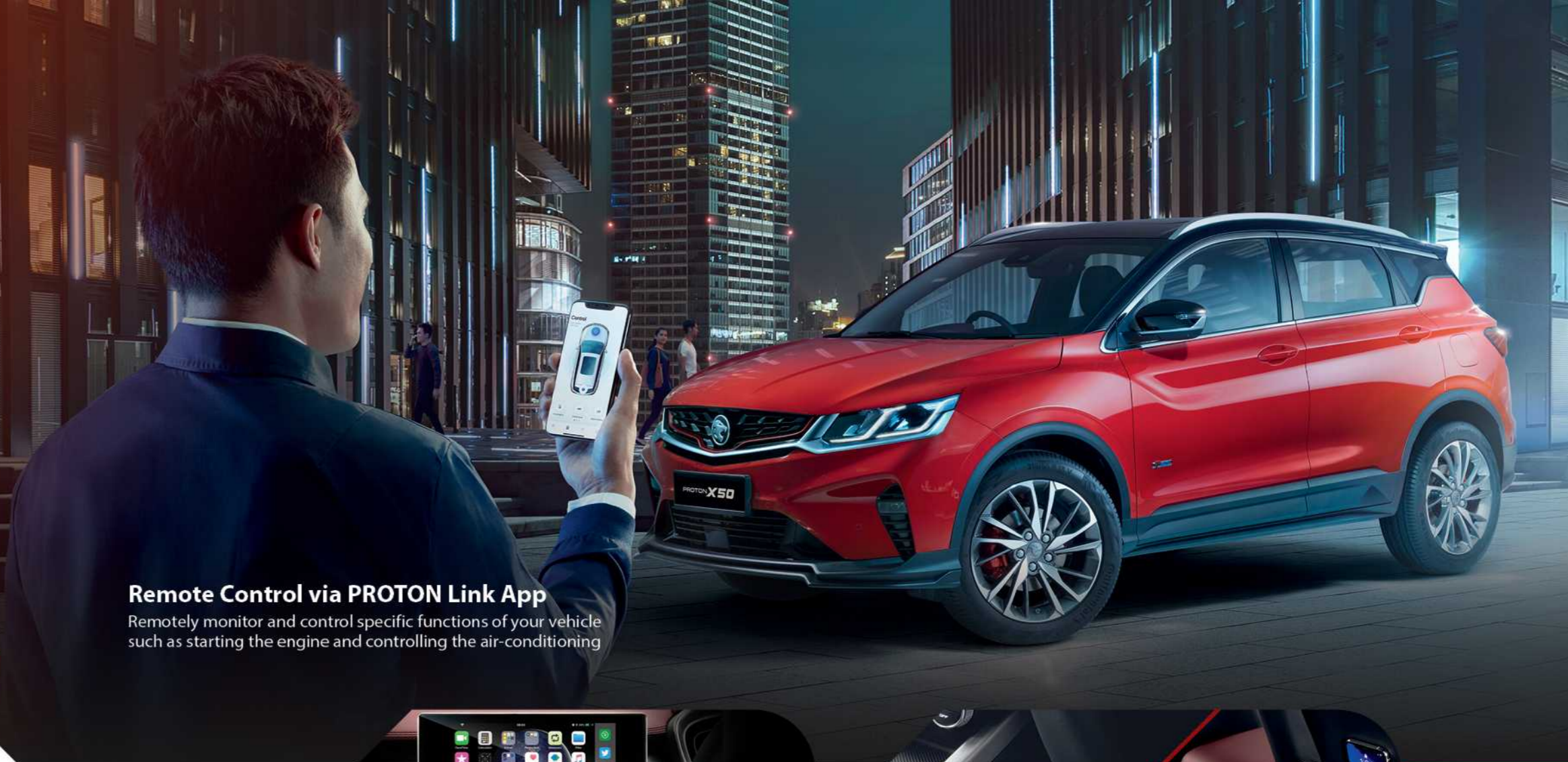
Remote Control via PROTON Link App Remotely monitor and control specific functions of your vehicle such as starting the engine and controlling the air-conditioning