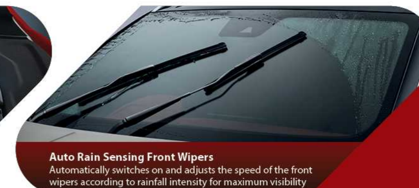
Auto Rain Sensing Front Wipers Automatically switches on and adjusts the speed of the front wipers according to rainfall intensity for maximum visibility