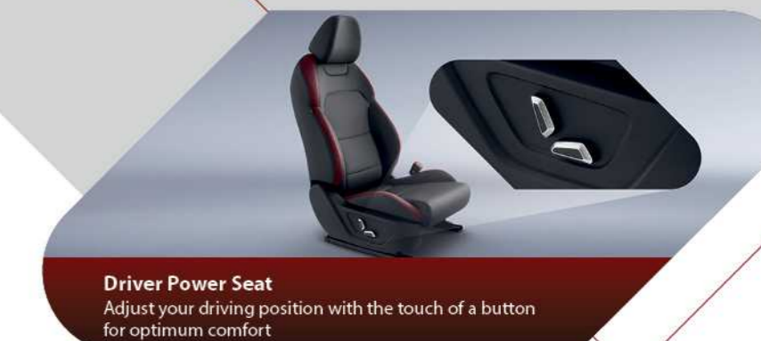
Driver Power Seat Adjust your driving position with the touch of a button for optimum comfort

“ From its bold design to its refined touches, the PROTON X50’s interior is designed to provide utmost comfort for you and your passengers creating an experience to amaze your senses ”