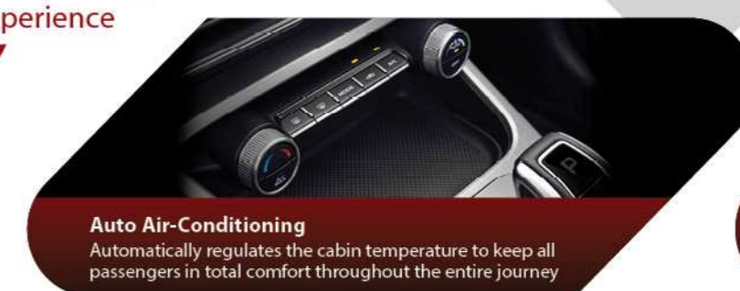
Auto Air-Conditioning Automatically regulates the cabin temperature to keep all passengers in total comfort throughout the entire journey