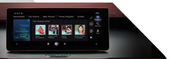
Online Music Streaming and Weather Forecast Access your favourite music and get the latest weather updates