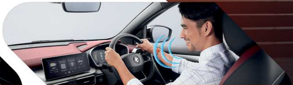
Voice Command Say "Hi PROTON" to gain control over your windows, air-conditioning, online navigation, online music streaming and more