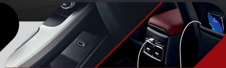
3 USB Ports You and your passengers will ride happy with 1 USB port at the front and 2 USB ports at the rear for convenient device charging