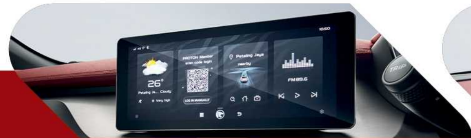
10.25" Infotainment Head Unit Floating touchscreen monitor that puts all your needs at your fingertips

“ Say hello to convenience and open up a new world of endless possibilities where you can take charge of your drive using your voice to stay in control, entertained and informed on the go ”