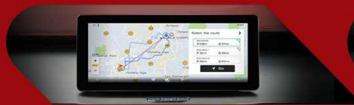
Online Navigation GPS Navigation that offers traffic alert warnings and driving directions to stay ahead