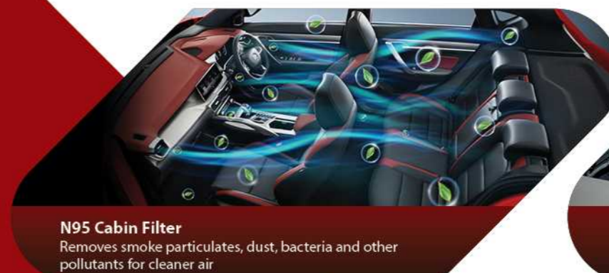
N95 Cabin Filter Removes smoke particulates, dust, bacteria and other pollutants for cleaner air