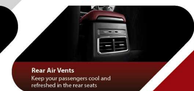
Rear Air Vents Keep your passengers cool and refreshed in the rear seats